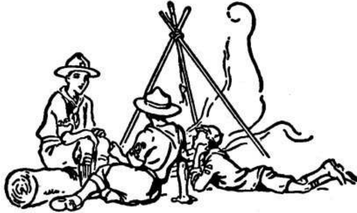
Members of the Scouting family: Cub, Scout and Senior Scout