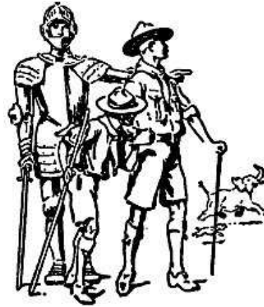
The Scoutmaster guides the boy in the spirit of an older brother.